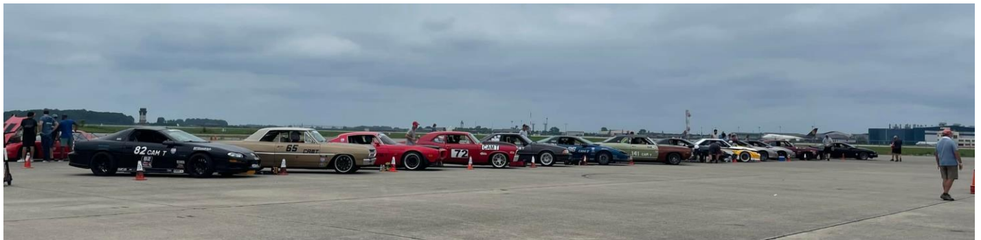
CAM T getting ready to run at the CAM Challenge

Well, Sue is into horses, so she is at the stable 7 days a week. We love to travel doing short 2-3-day trips and a couple of week-long ones in the off season. We spend a lot of time with the grand kids; Gwen is 5, Gage is 13 and we have another on the way in late fall. I am also a huge reader, enjoying science fiction and detective stories.